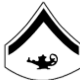
CADET LANCE CORPORAL