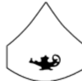
CADET PRIVATE FIRST CLASS